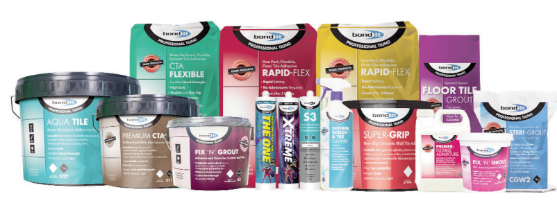
Part of the Bond It Professional Tiling Range